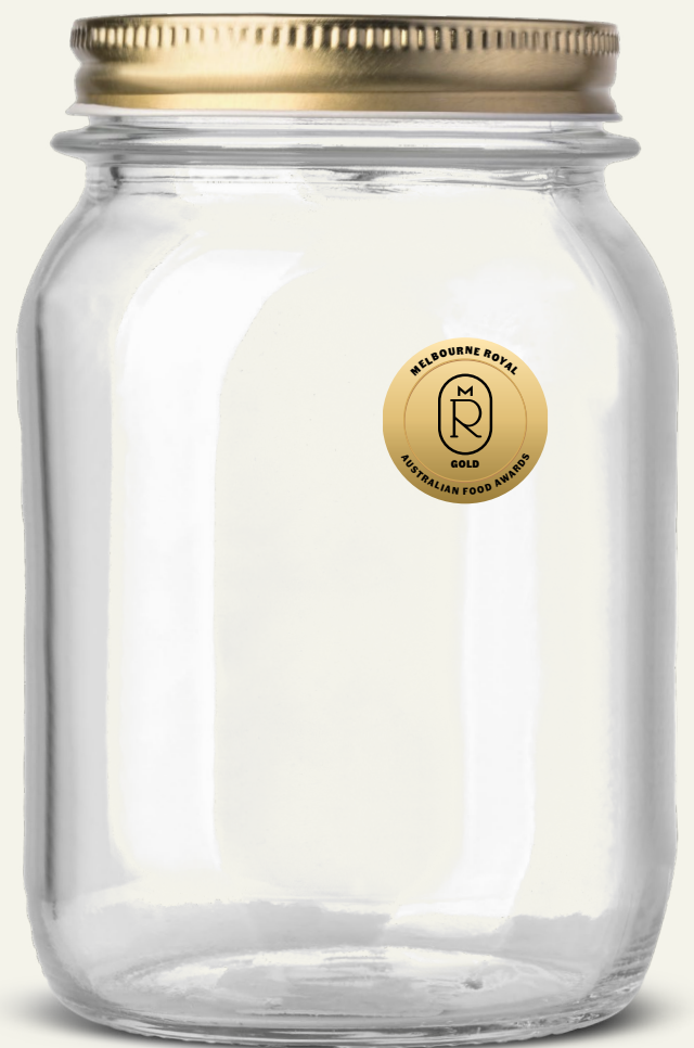
Medal placement example

Prior to printing please send artwork in a PDF format to Melbourne Royal, marketing@melbournroyal.com.au for approval (approval turnaround approximately 48 hours).