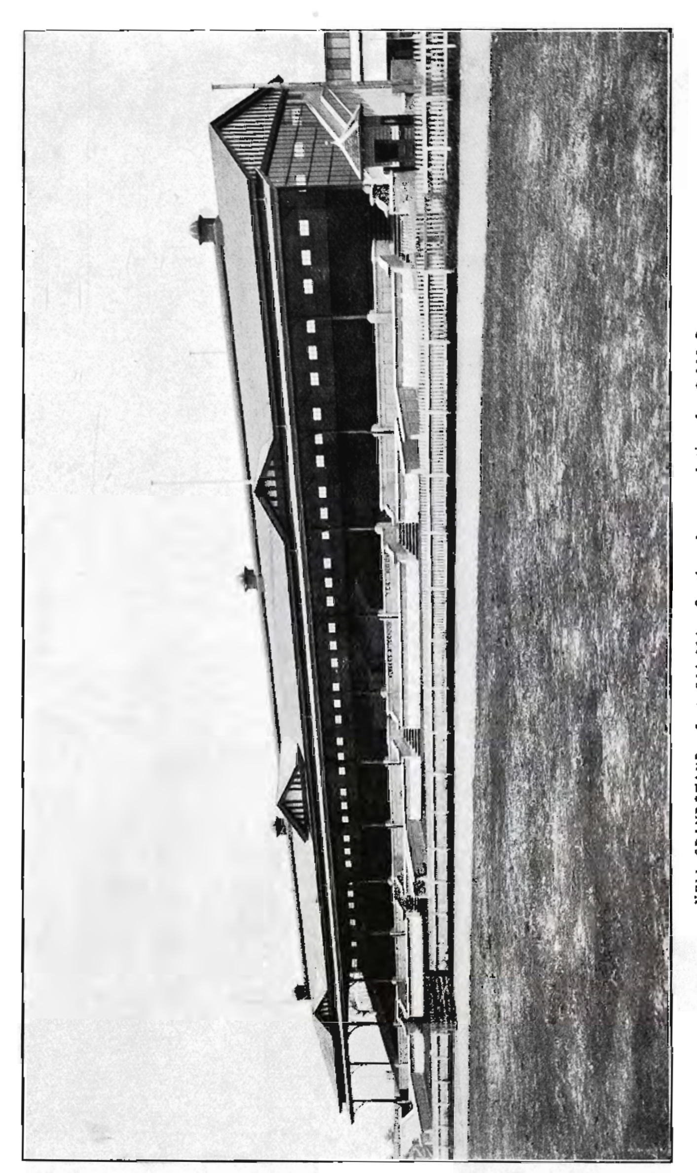
NEW GRANDSTAND -Cost £11,664. Seating Accommodation for 2,600 Persons.