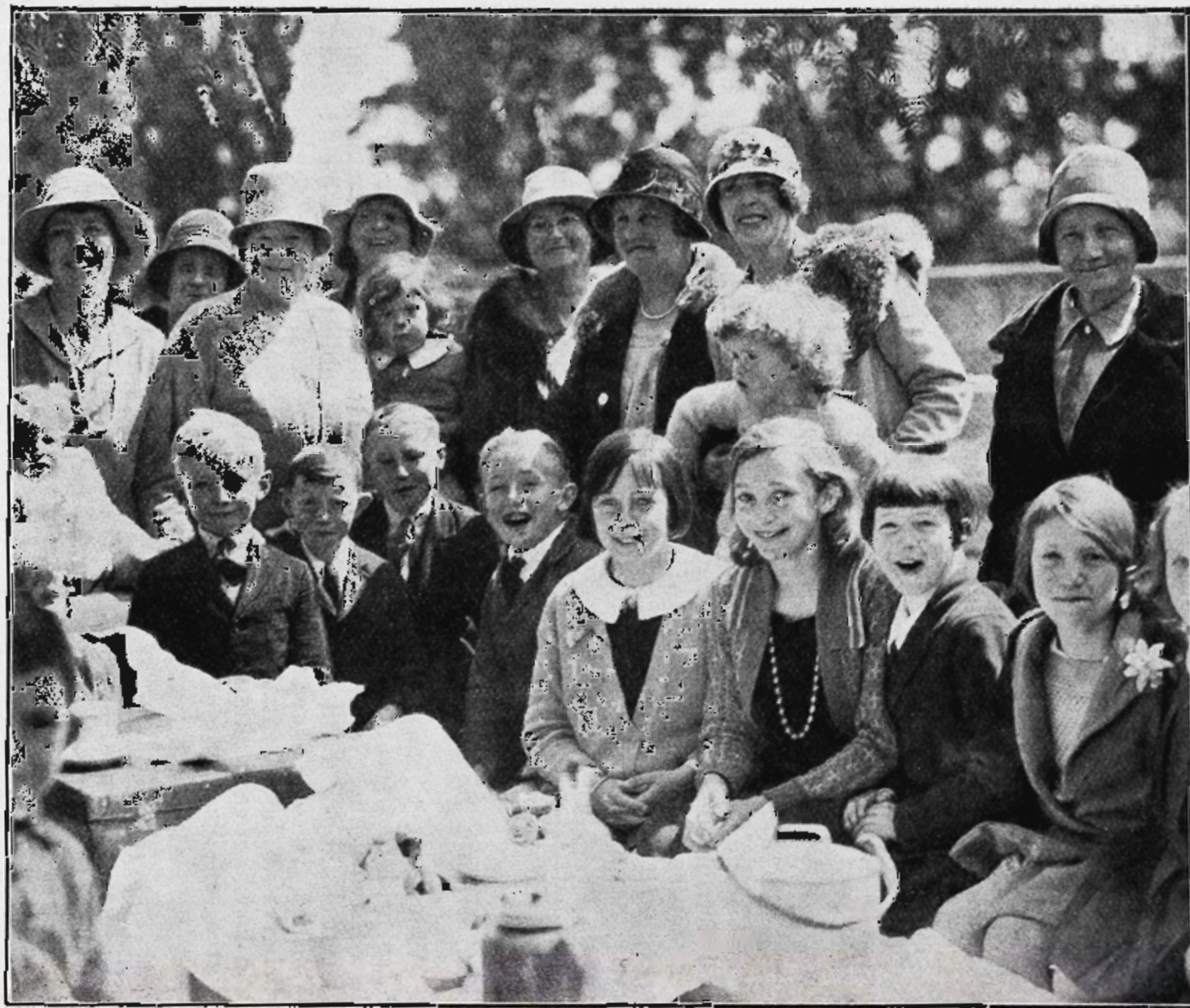
A HAPPY PICNIC PARTY AT THE SHOW.