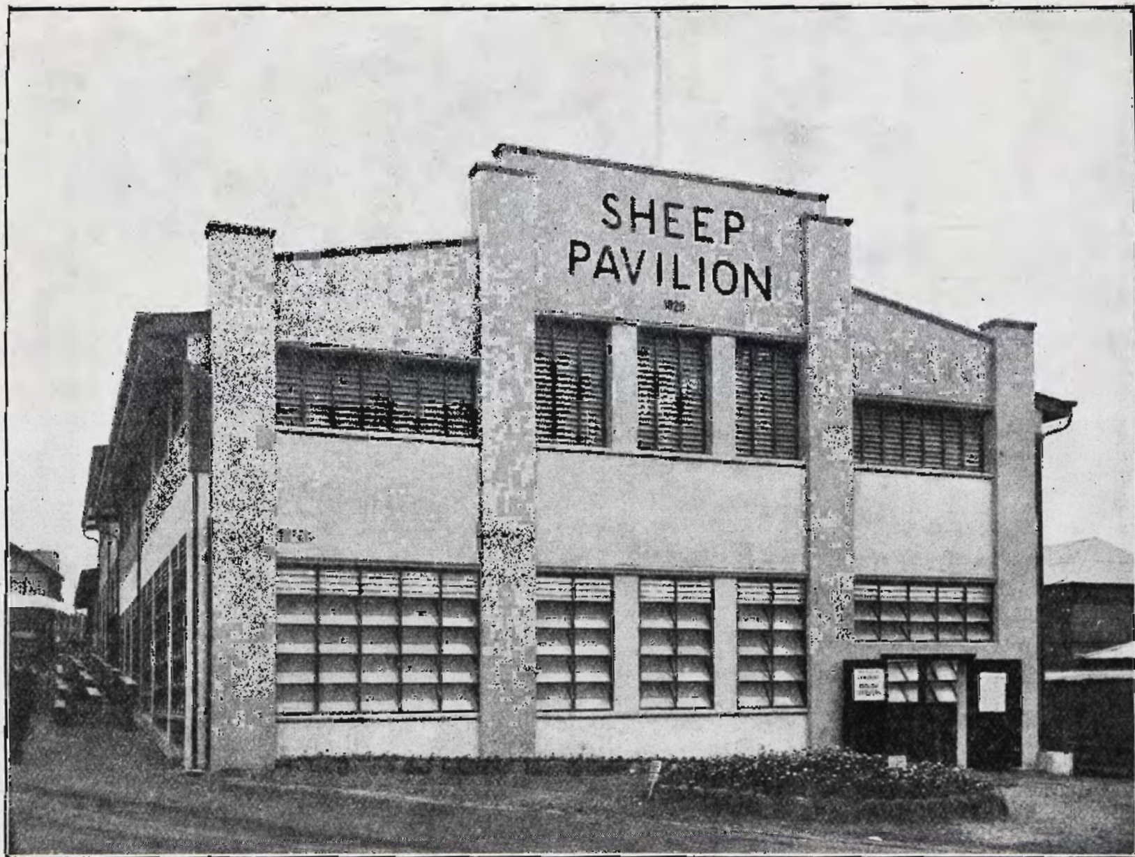
THE NEW SHEEP PAVILION.