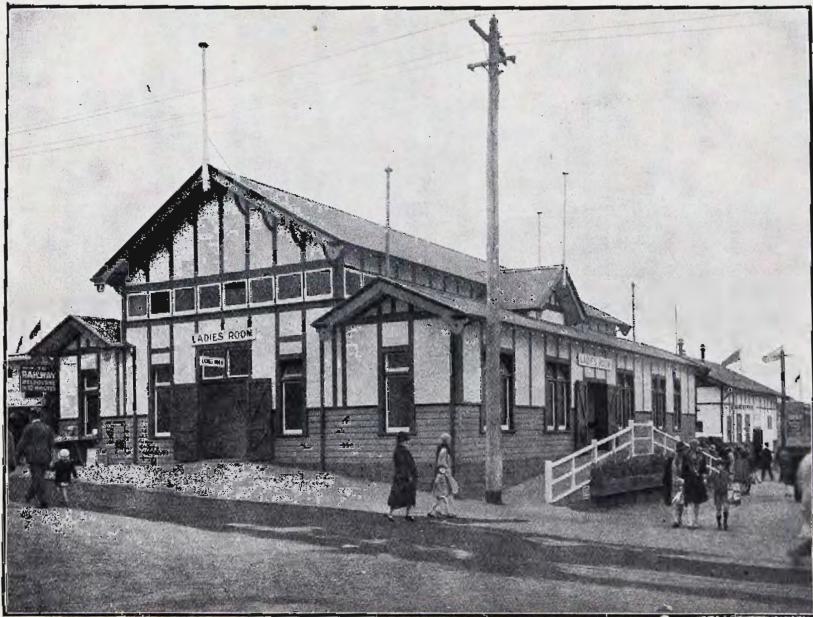
THE LADIES' RETIRING-ROOM, WITH CRECHE ADJOINING.