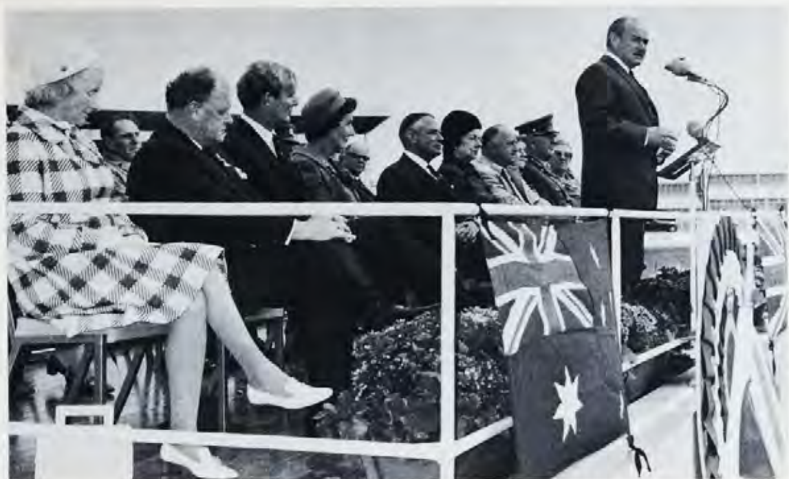
The Governor-General Sir Paul Hasluck Opening the Royal Show.