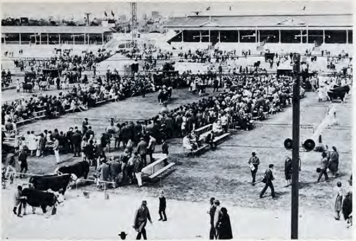
One of the Beef Cattle Judging Rings on Judging Day.