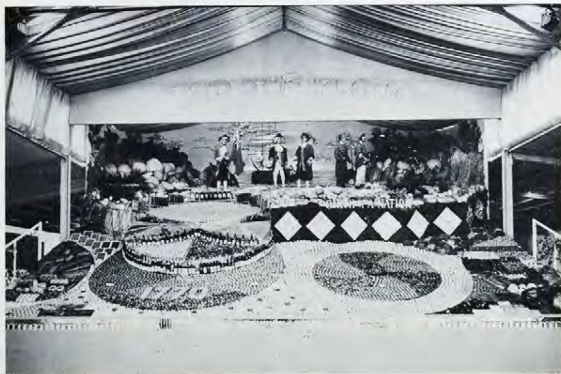
Produce Display — Cook Bi-Centenary Theme