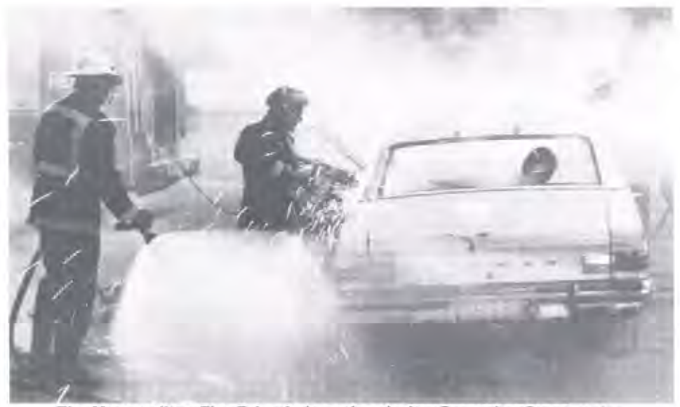
The Metropolitan Fire Brigade in action during Operation Spectacular.

tralian Meat Board (now the A.M.LC.), Australian Primary Producers Union, Australian Farmers' Federation and the Sale Agricultural Society.