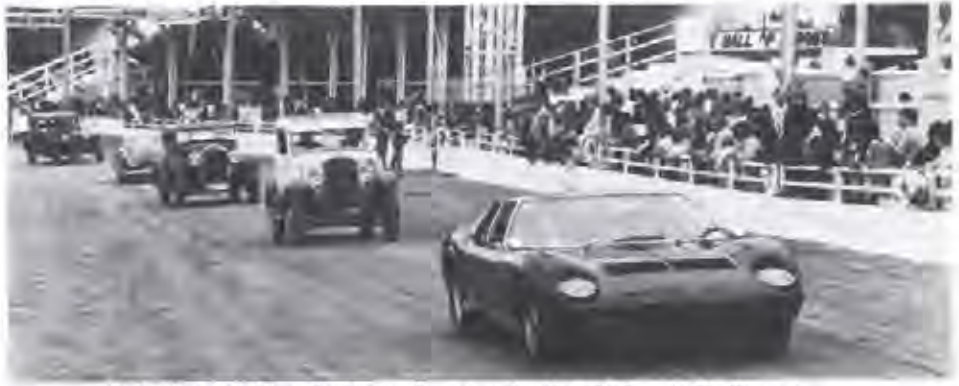
A feature of Showlest was the cavalcade of classic Italian cars.

Horse of the Year, Swan Premium Australian Invitational Showjumping, Aussco Standard bred sales, Oktobertest, Speedway motor cycles event, International Plastic Modellers' exhibition, National Sporting Goods Expo, Toyworld Exhibition, Vintage Car Club swap meet, Ski gear sale, 3 EON FM School Eisteddlod, Finish of the "Sun Fun Run". Fencing demonstrations, Tyre exhibition, Tropical plant sale, Home Flair Furniture exhibition, Prestige motor car auction, Livestock quarantine, Edments crystal sale.