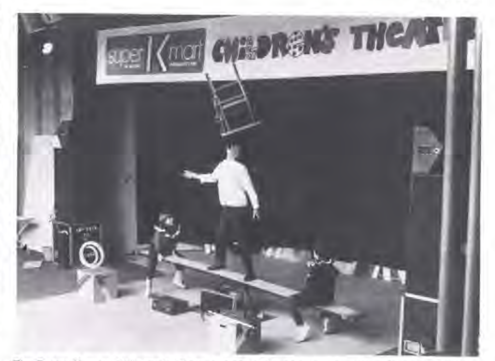
The Super K mart Children's Theatre, one of the popular new attractions at the 1986 Royal Show.