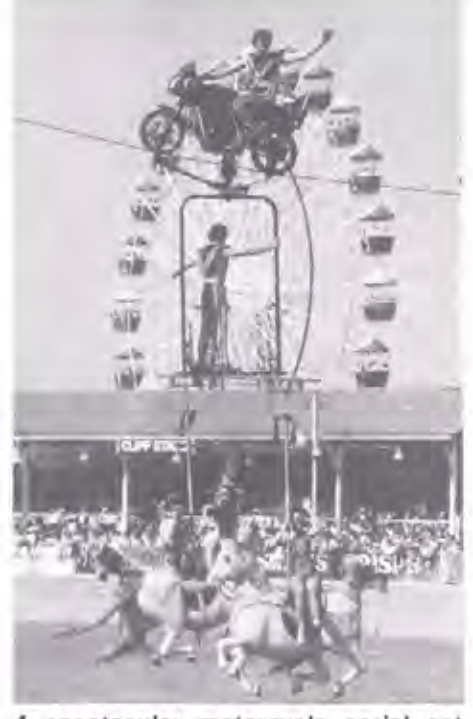
A spectacular motorcycle aerial act performed by the Brophy Brothers was a highlight of the 1987 arena programme.

AMP Lawn with its programme of music, magic, martial arts and milking