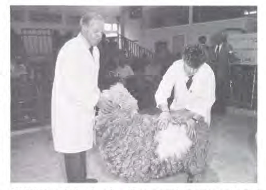
The Commonwealth Bank Farm Animal Expo represented a new concept in rural education at the Show.

Australia's mining history, the gold mining industry, development of mines and the exploration for and processing of minerals were essential components of this exhibit.