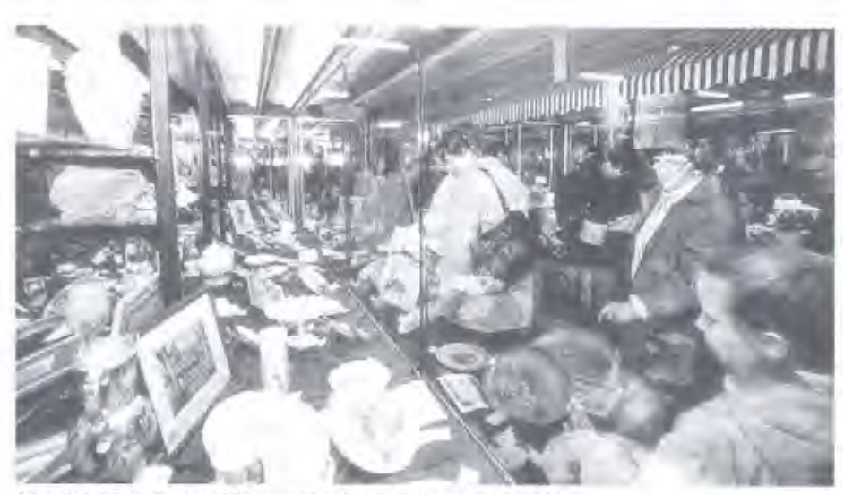
Interested visitors view one of the many art and crafts displays at the Royal Show.