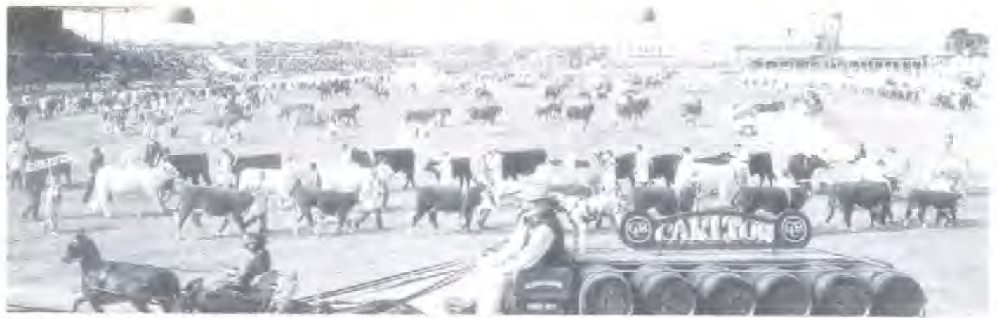
Champions on show in The Grand Parade, one of the most spectacular and popular events of the Royal Melbourne Show.

Another special feature was in Horticulture which introduced a substantially bigger line up of exhibitors in the Horticulture Pavillon and the return of the popular Floral Clock to the Showgrounds (last seen at the Show in 1965).