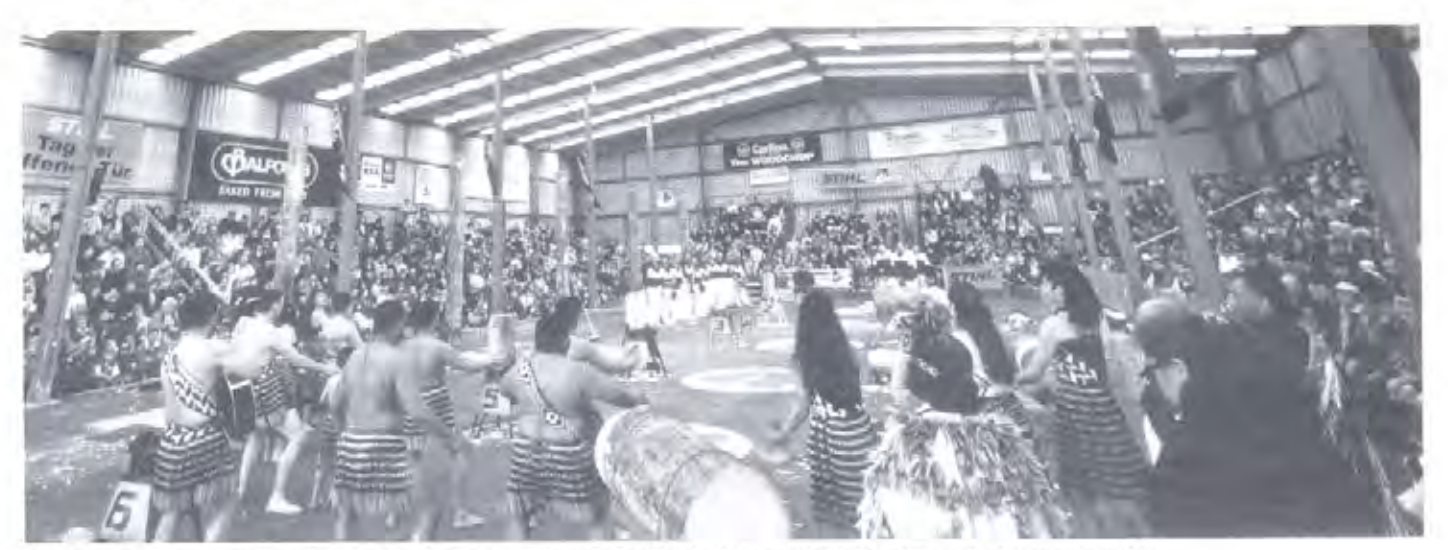
New Zealanders warm up the crowd for one of the New Zealand v Australia Test Malches in the spectacular Royal Show Woodchopping competition