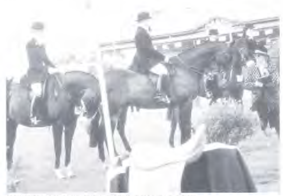
Concentration amongst the competitors in the prestigious Garryowen competition.

Other agricultural competitions run by the Society include Grains, Hay & Chaff, Fleece, Honey, the Steer Carcase and the Bacon Pig Carcase.