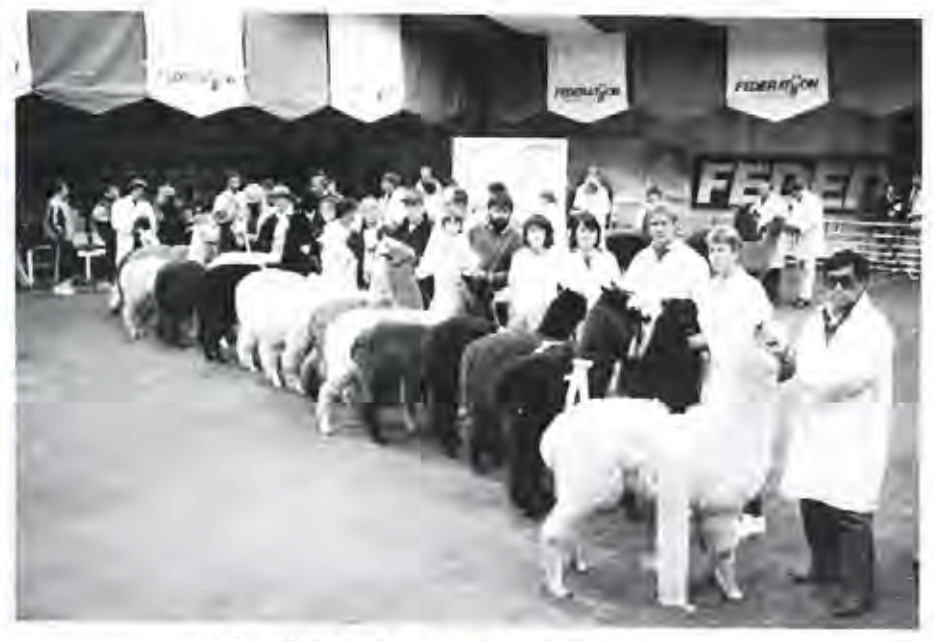
Alpacas made their debut in the judging ring this year.

It was timely and appropriate, during one of the most difficult and trying economic recessions we have faced, that the RASV demonstrated its solidarity and support for rural industries and the people who run them.