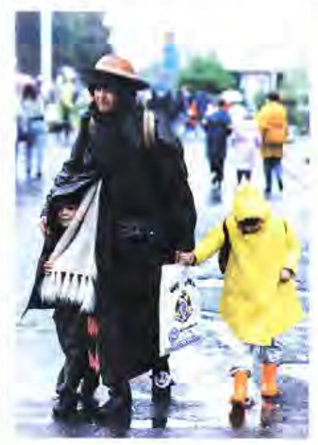
Inclument weather was no object to this dedicated Showgoing family.

"This competition is unique in that when it was established, there was no vehicle for judging of commercial dairy herds, unlike stud breeders who have always had the showring as an arena for competition. Not only do the entrants benefit from the experience gained by their participation, but many hundreds of Victorian dairyfarmers have gained invaluable knowledge from attending the well run field days held on the winning farm each year.