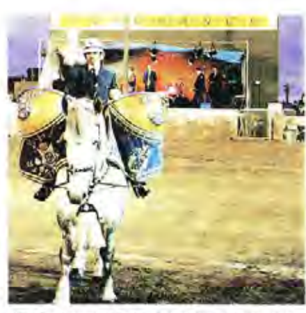
Gendarme, Victoria Police Drum Horse leads the Victoria Police rock band, Code One.