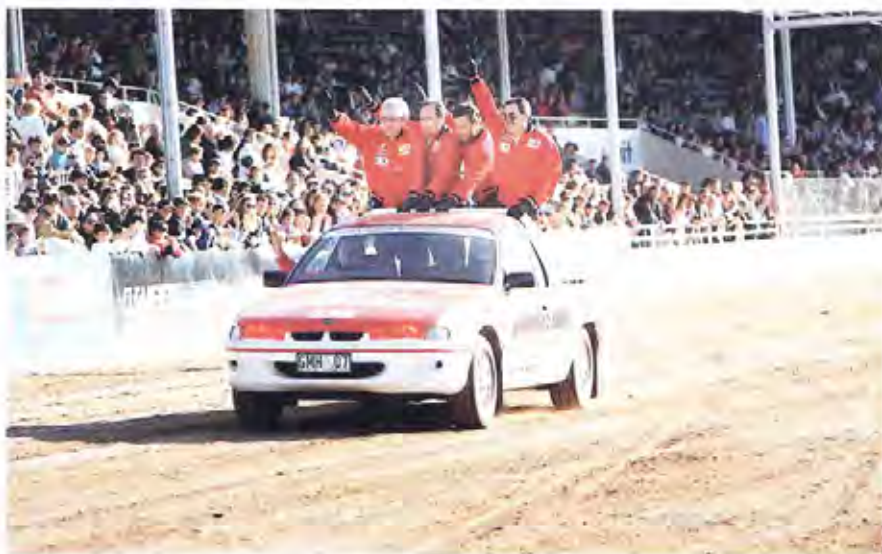
• While at the Royal Melbourne Show, the Bridgestone Holden Precision Driving Team celebrated its 5000th performance.

At its meeting on June 22 1993, the Council approved the granting of naming rights to the Royal Melbourne Show, to St.George Bank Limited. This was the first time in the history of the Society that naming rights to the Show have been granted.