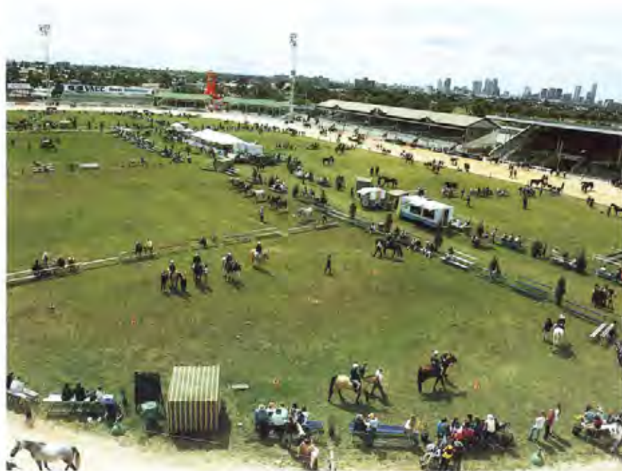
• The 1994 Weekly Times Royal Summer Horse Show.

During the year the Australian Corriedale Association Ltd. and the Australian Corriedale Association Ltd. (Vic. Branch) ceased to use the RASV as their secretariat.