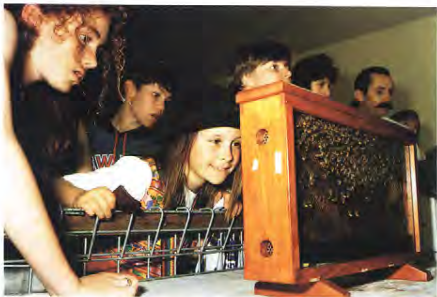
• The apiculture display fascinated Harvest Hall visitors.

The expert judges who assess the entries give constructive criticisms for individual entrants, and the field days on the properties of the winners offer another avenue of education, for the public as well as entrants.