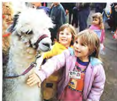
• Getting to know an alpaca is part of the Show experience.

Following the changes to local government boundaries, in December 1994 the Showgrounds ceased to be a part of the City of Essendon and came under the authority of the Melbourne City Council. At about the same time the Victorian Minister for Planning authorised amendments to the Town Planning Scheme regarding the Showgrounds. These amendments will permit a greater 'right of use' of